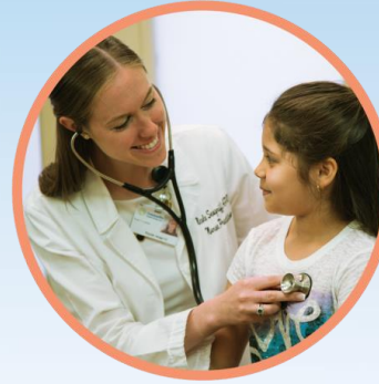
Complex Integrated Pediatrics