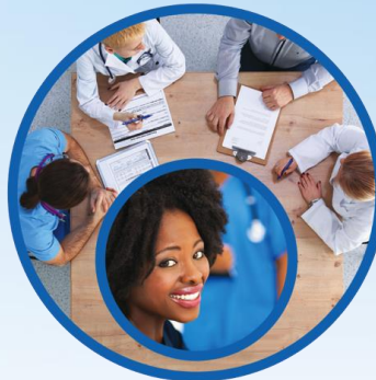
Complex Care Management